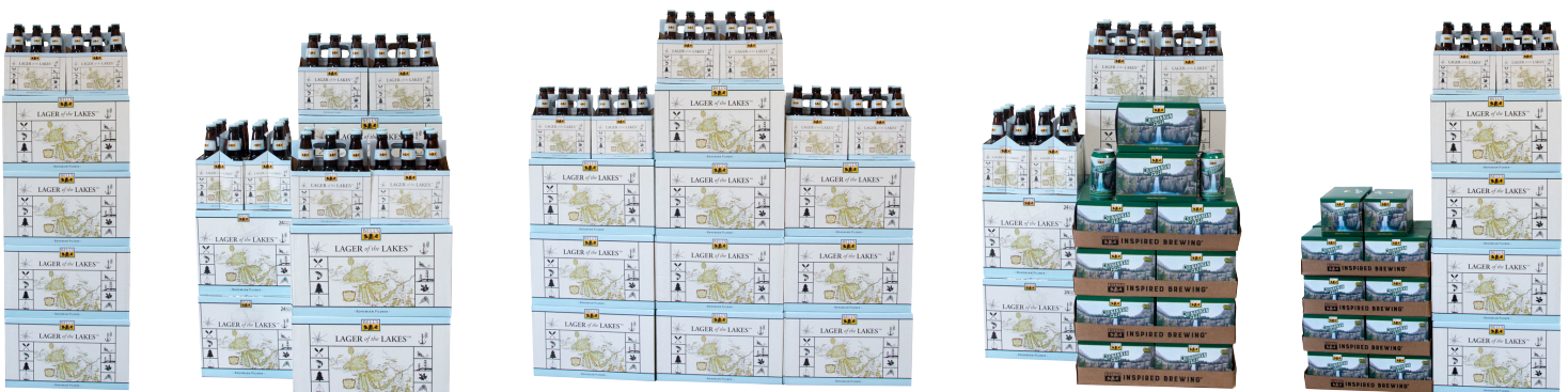
DISPLAYED WITH QUINANNAN FALLS