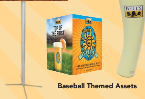
Baseball Themed Assets