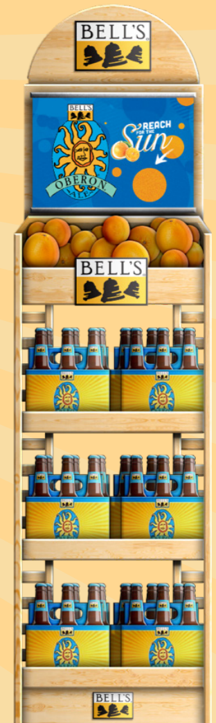
Wood Beer Rack