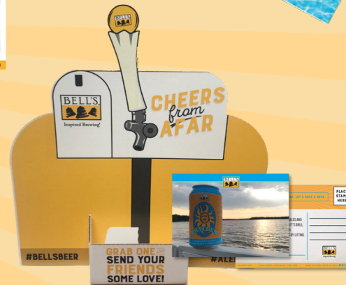
Oberon Mad-Lib Postcard (with case card holder)