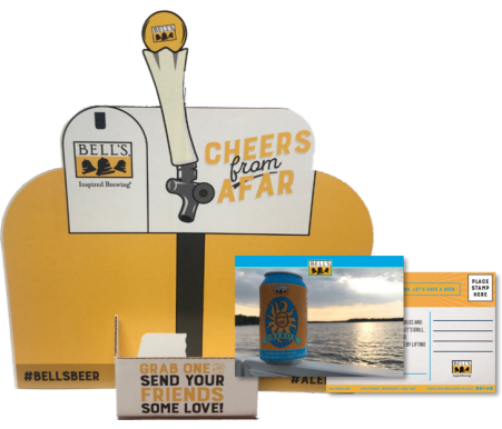
Oberon Mad-Lib Postcard (with case card holder)