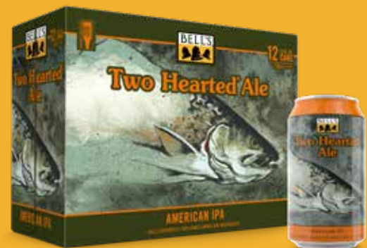
12pk 12oz Cans