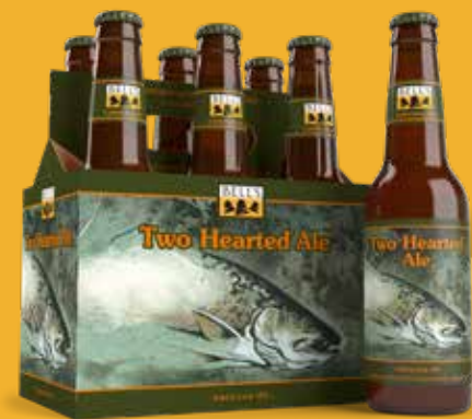
6pk 12oz Bottles