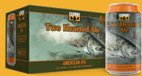
6pk 12oz Cans

Draft available: 1/4 Barrel Keg 1/2 Barrel Keg