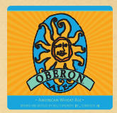
American Wheat Ale