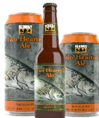
Two Hearted Ale 7% American IPA Pair with Grapefruit