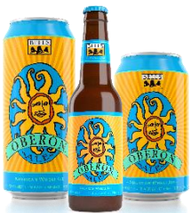
Oberon Ale 5.8% American Wheat Ale Pair with Oranges