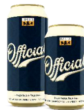
Official 6.4% Hazy IPA Pair with Mango